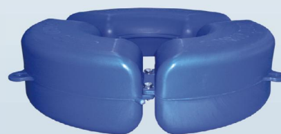
3 pieces coupled floater