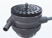
Rotary sprinkling plate